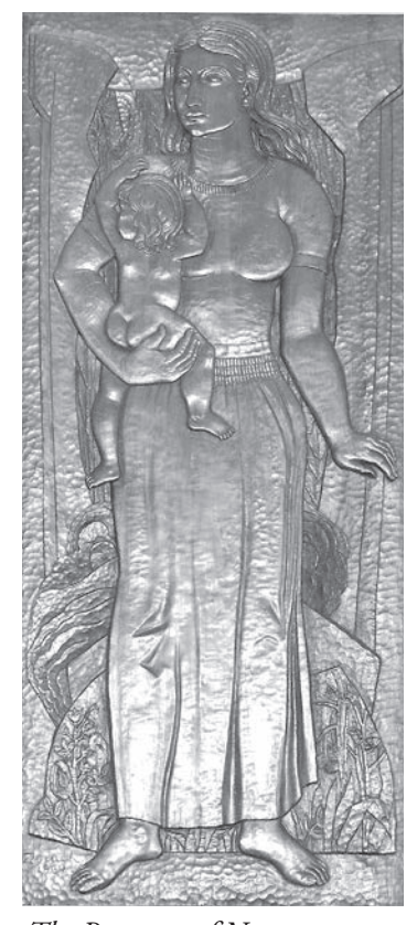
The Resources of Nature