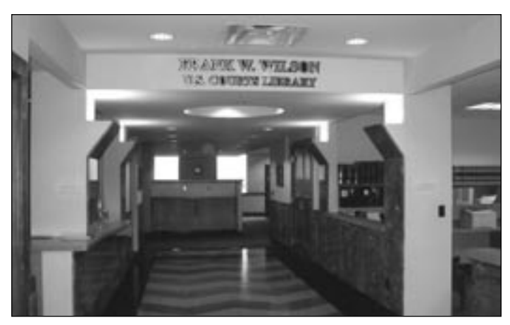
LIBRARY ENTRANCE—This is the entrance to the Frank W. Wilson U.S. Courts Library on the second floor of the U.S. Courthouse in Chattanooga.

The use of the court libraries is not limited to court personnel. Library policy adopted by the Sixth Circuit Judicial Council in 1995 says that attorneys admitted to federal practice may use the libraries during regular business hours at the discretion of the resident librarian, who must be present.